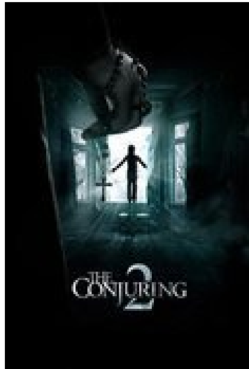
The Conjuring 2 ★★★