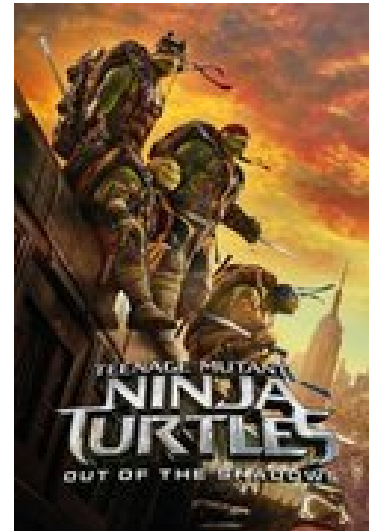
Teenage Mutant Ninja Turtles: Out of the Shadows ★